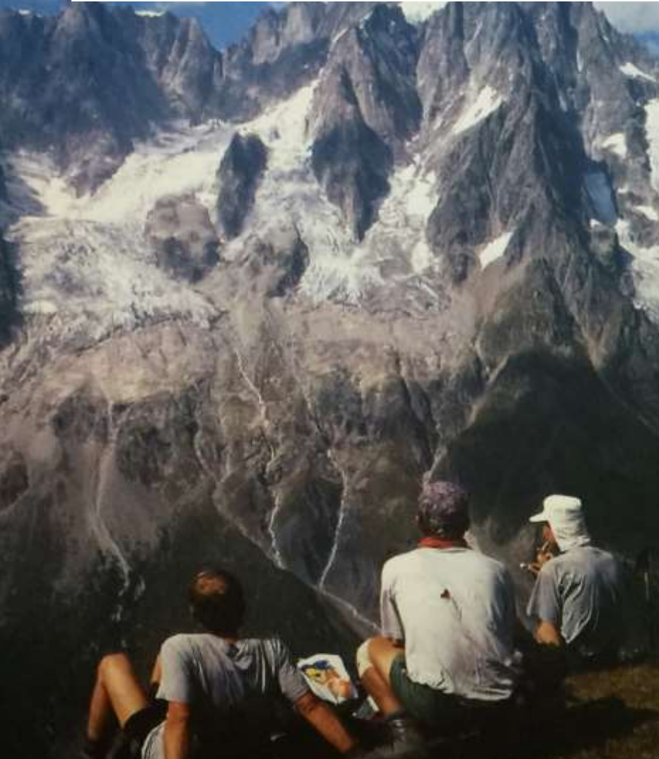
Val Ferret (I), 2-9-1992