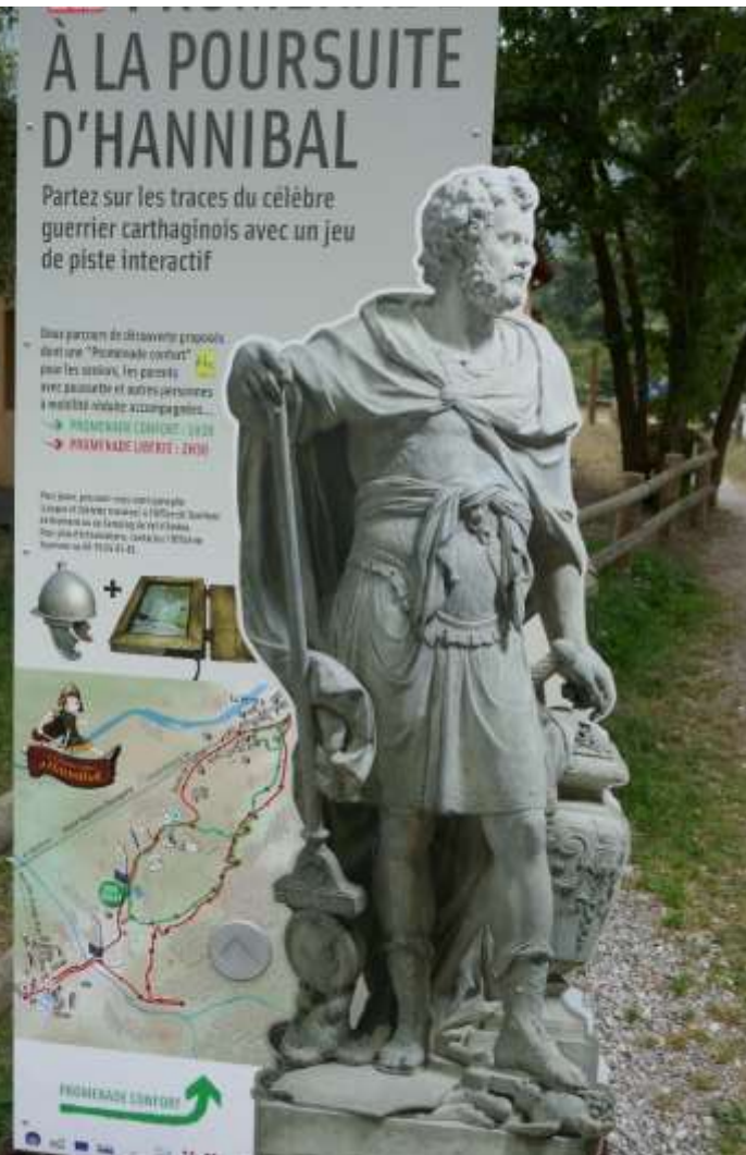
Maurienne (F), 31-8