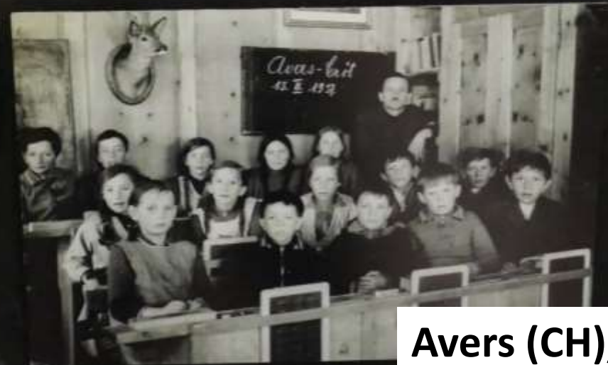
Avers (CH), 29-7