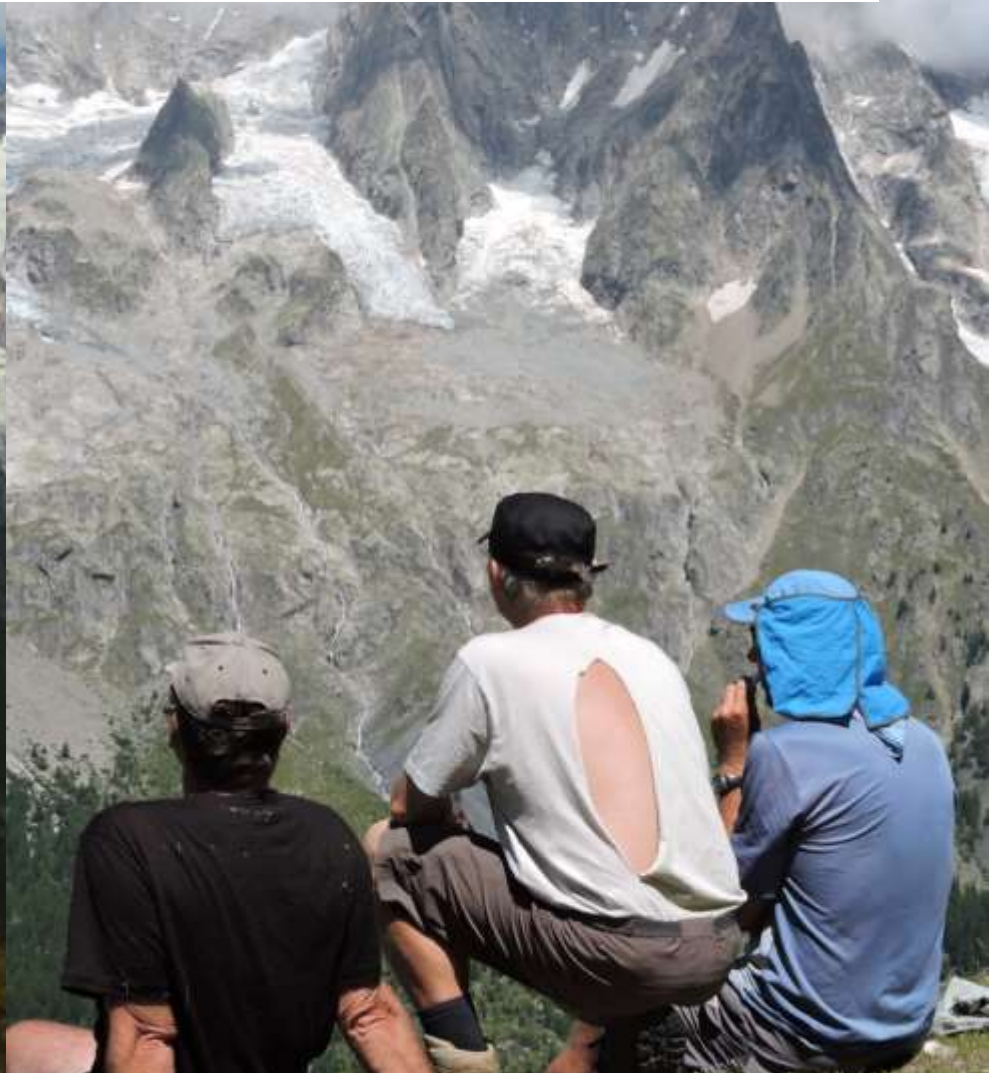
Val Ferret (I), 22-8-2017