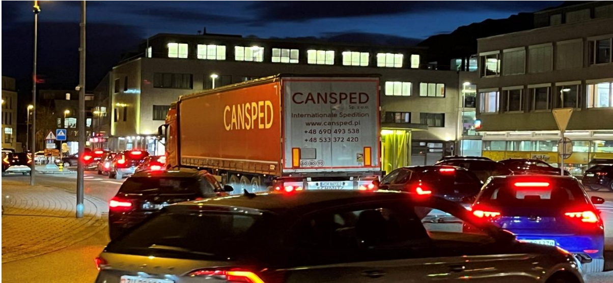
Rush hour in Schaan/LI