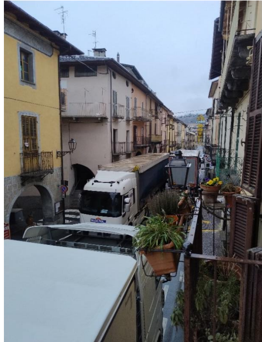
Hundreds of trucks daily cross the town centre of Demonte in the Stura Valley.

By adopting comprehensive reforms, the Alpine region can balance connectivity with environmental preservation and community well-being.