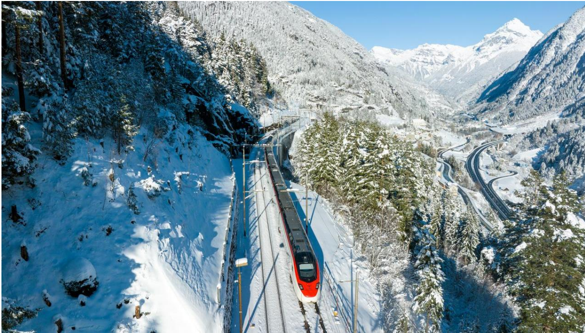
Train at the Gotthard/CH

concerns of the local population and the environment. 12 All these overlaps of use and demand require that the best possible solution be found, while recognising the limited available resources.