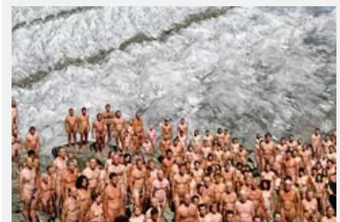
600 volunteers faced the bare facts on the Aletsch Glacier on behalf of climate protection.

http://www.krone.at/index.php?http%3A/wcm.krone.at/krone/S25/object_id_76238/hxcms/ (de)