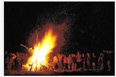
One of many watch-fires lit as part of the campaign.

Information: http://www.feuerindenalpen.org (de/fr/it/en); http://www.cipra.org/ch (de)