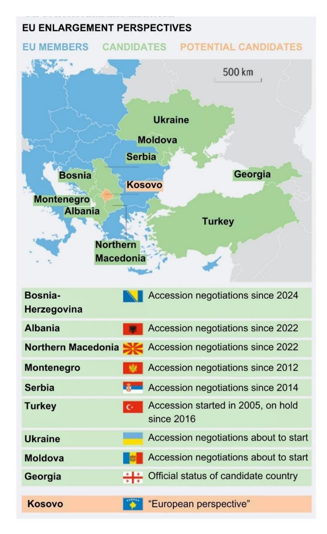
Figure 2: Enlargement perspectives; Graphic: APA/ORF