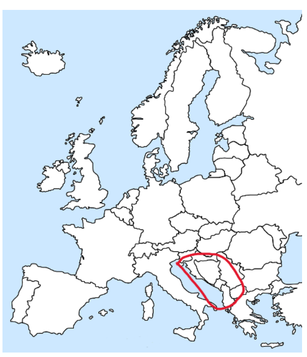
Figure 1: Focus area of this report

This document contains a summarized analysis of current climate policy in the Western Balkan countries plus Croatia (Figure 1). The focus is on the status of climate policy adoption and implementation for Croatia, Bosnia and Herzegovina, Montenegro, Kosovo, Albania, Serbia and North Macedonia.