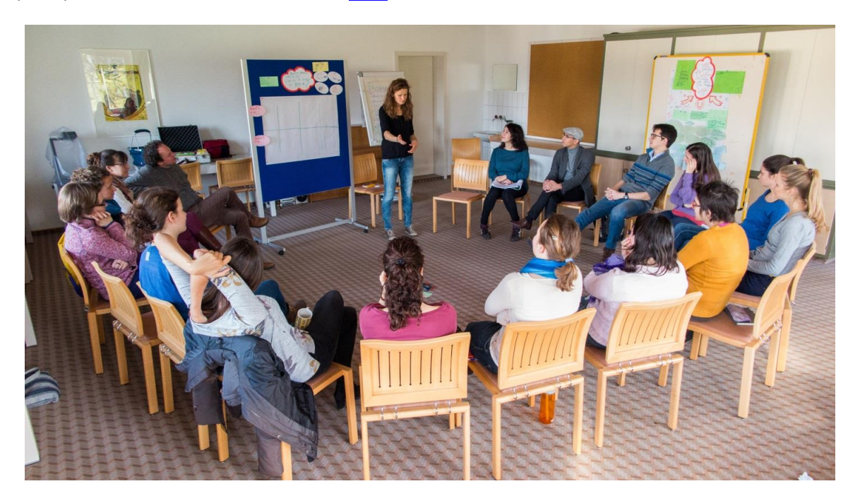
Impression of the start of Open Space, with the empty schedule in the background

does not really commit to any groups, and just spends his or her time "hanging around". This role is also valuable, as perhaps the greatest idea is "born at the bar". \rightarrow Here you can find out more about Open Space. Further information also \rightarrow here.