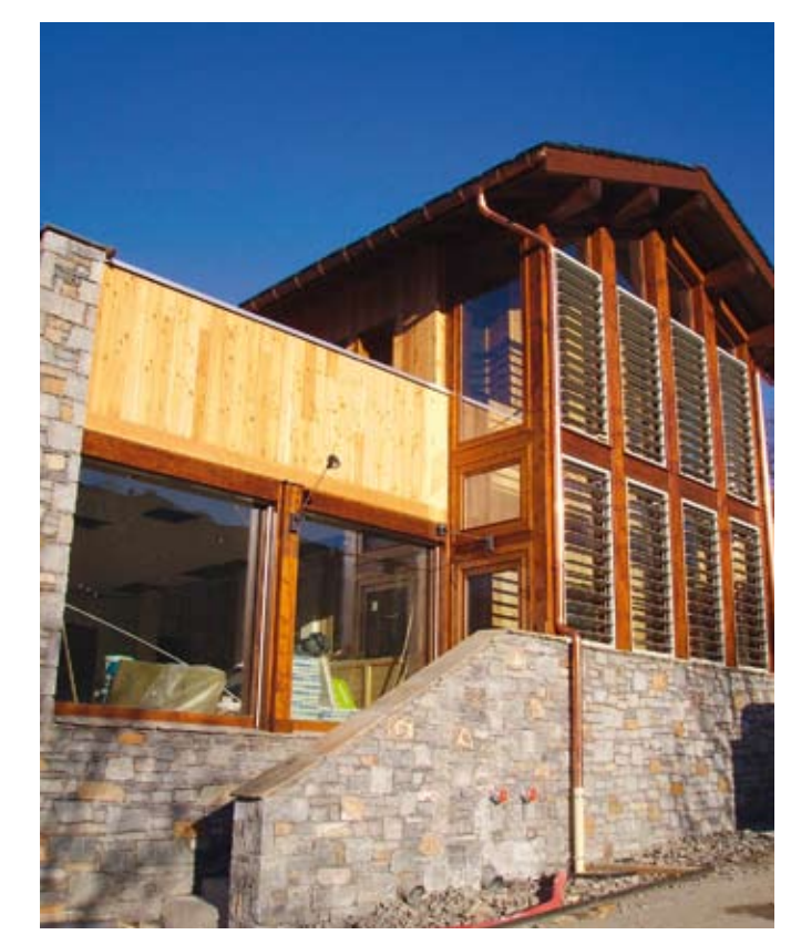
Strikingly aesthetic: the day nursery centre in Saint Martin de Belleville uses a minimum of heating energy.

Then came the excursion and, with it, the infection. It consisted of a mix of knowledge, gathered as part of CIPRA's climalp project, and the enthusiasm of the Austrian timber builders. Back in Savoie again, the delegation members' infectious enthusiasm spread to their colleagues. The municipal council of Saint Martin de Belleville resolved that its new day nursery should be a "beacon" for energy-efficient architecture. It was officially opened at