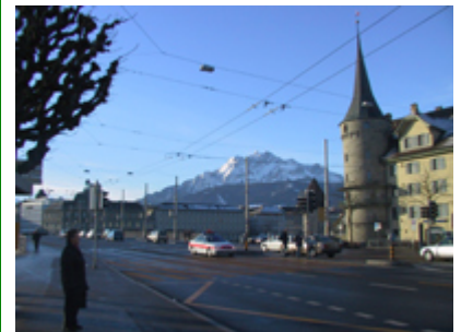
Alpine cities - the convergence of mountains, landscape and urban life

Information: http://www.montanea.org/html/formulaire/formulaire_colloques.html (de/fr/it/en)