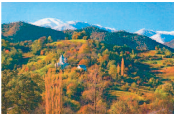
Borjomi-Kharagauli National Park / Georgia National park administration, WWF and German development cooperation together for man and nature in Georgia

Firstly, the national coordinators are ensuring an exchange between all parties involved, above and beyond national borders. This will help to resolve conflict through practical cooperation. Secondly, decisions are also taken in close collaboration with the local population, whose needs and own suggestions should provide guidelines for the project.