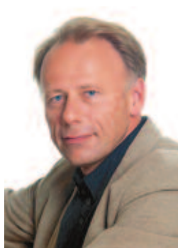
Federal Environment Minister Jürgen Trittin

Mountain regions are particularly sensitive ecosystems. They require special protection efforts. For the Alpine region, the Alpine Convention and its Protocols provide the foundations for international cooperation aimed at preserving this unique habitat. At the VIIth Alpine Conference in 2002, the competent ministers of the Parties to the Alpine Convention resolved to incorporate their experiences from the Alpine process into "International partnership for sustainable development in mountain regions". This was agreed at the World Summit on Sustainable Development in Johannesburg, and further developed at the "Global Mountain Summit" in Bishkek, Kyrgyzstan.