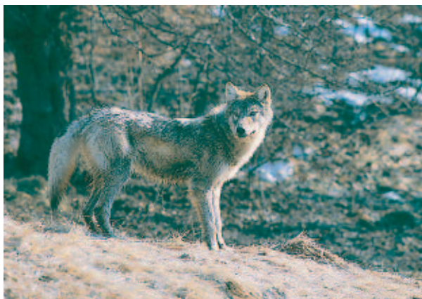
Carpathian wolf

The highest elevation is the Gerlach Peak (2,655 m) in the High Tatras (Slovakia). Around half of the Carpathians are covered in forest, which are home to some of the last remaining primeval forest in Europe. The Carpathian forests are a vital link between the Nordic forests and the forest regions of Western and South-Western Europe. One-third of all European vascular plants (with over 4,000 species, including 481 endemic species) are found in the Carpathians. The Carpathians are still home to a number of large predators (8,000 bears, 3,000 lynxes, 4,000 wolves) and the imperial eagle, threatened with worldwide extinction. Around 16 % of the Carpathians are under some form of protection.