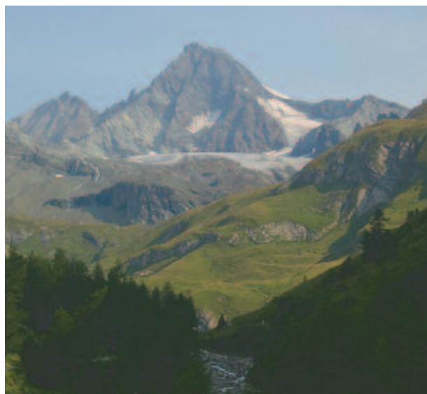
The experience gained in the Alpine region can also be useful for other mountain regions

The formulation of international agreements aimed at promoting and regulating sustainable development in a mountain region is a protracted process. Work to create the legal framework – the Convention and its nine Protocols to date – has been underway since 1989. The Alpine Convention entered into force in the eight contracting states in 1995, followed by its nine protocols in Austria, Liechtenstein and Germany in 2002. In 2003, Slovenia ratified all protocols, whilst Monaco and France ratified some of them.