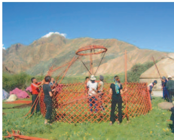
Yurt construction on the summer pasture of an AGOZA village in a valley of the Narynskaya Oblast (2,800 m) / Kyrgyzstan.

The experiences from the network of communities “Alliance in the Alps”, which was initiated by