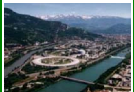
The "Highland Nanotechnology Zone" in Grenoble