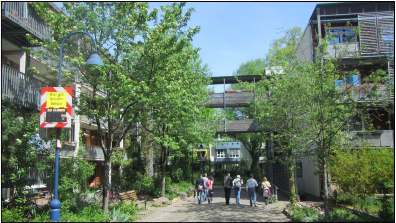
New legal and financial arrangements > Example/picture Vauban in Freiburg