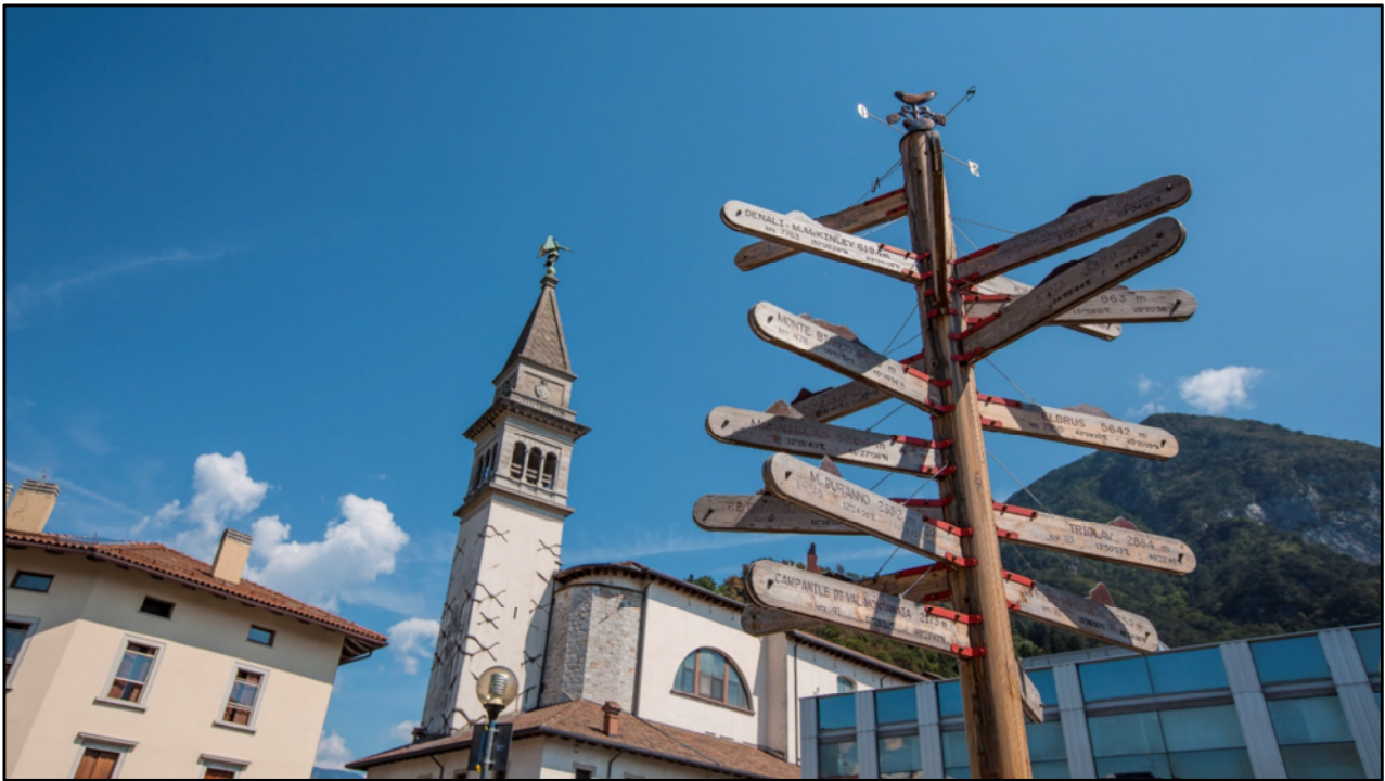
Multifunctional uses and spaces