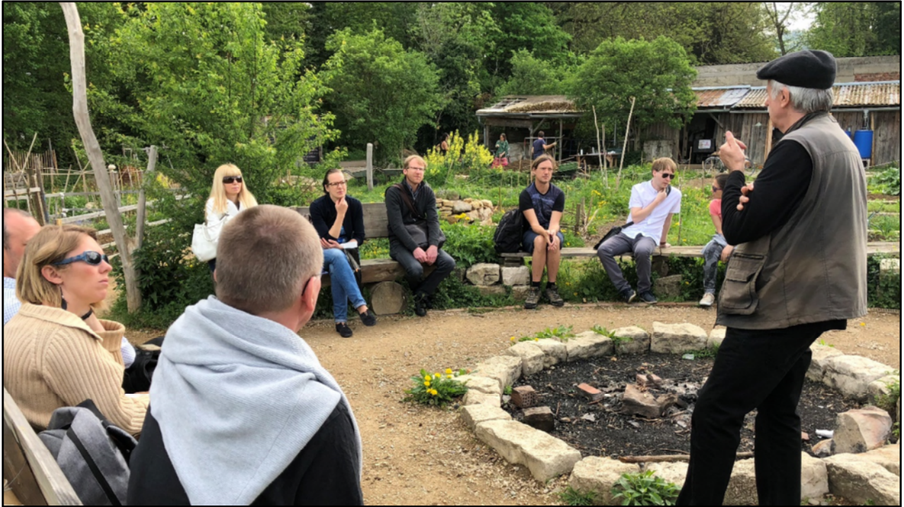
Alternative picture: New legal and financial arrangements > Example/picture Vauban in Freiburg