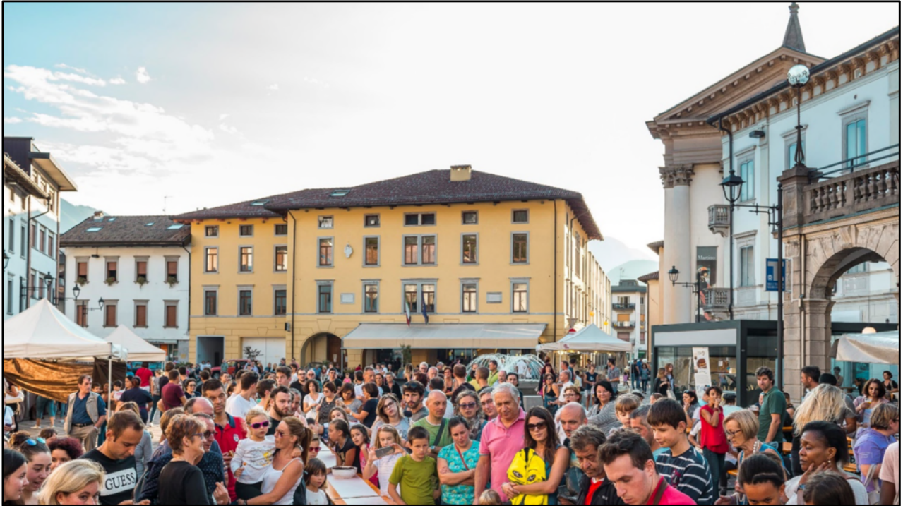
Involving population and key stakeholders > Example/picture Tolmezzo