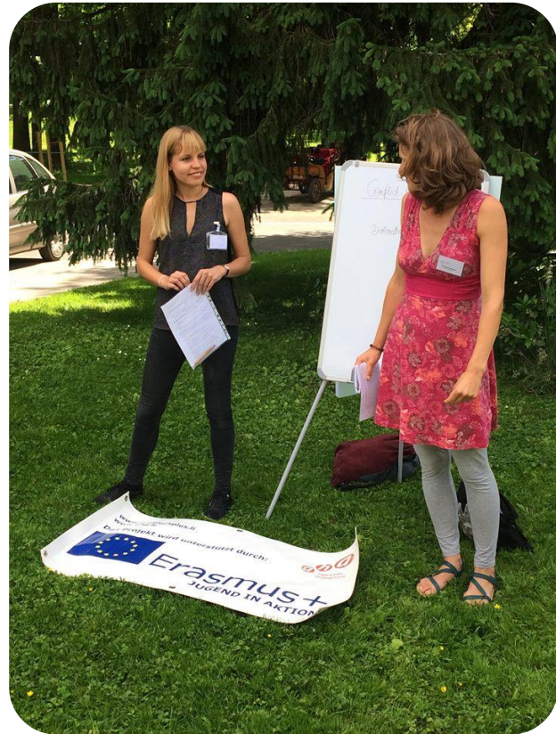
Picture 2: Living Labs workshop as a part of the annual conference “Tourism and Quality of Life”