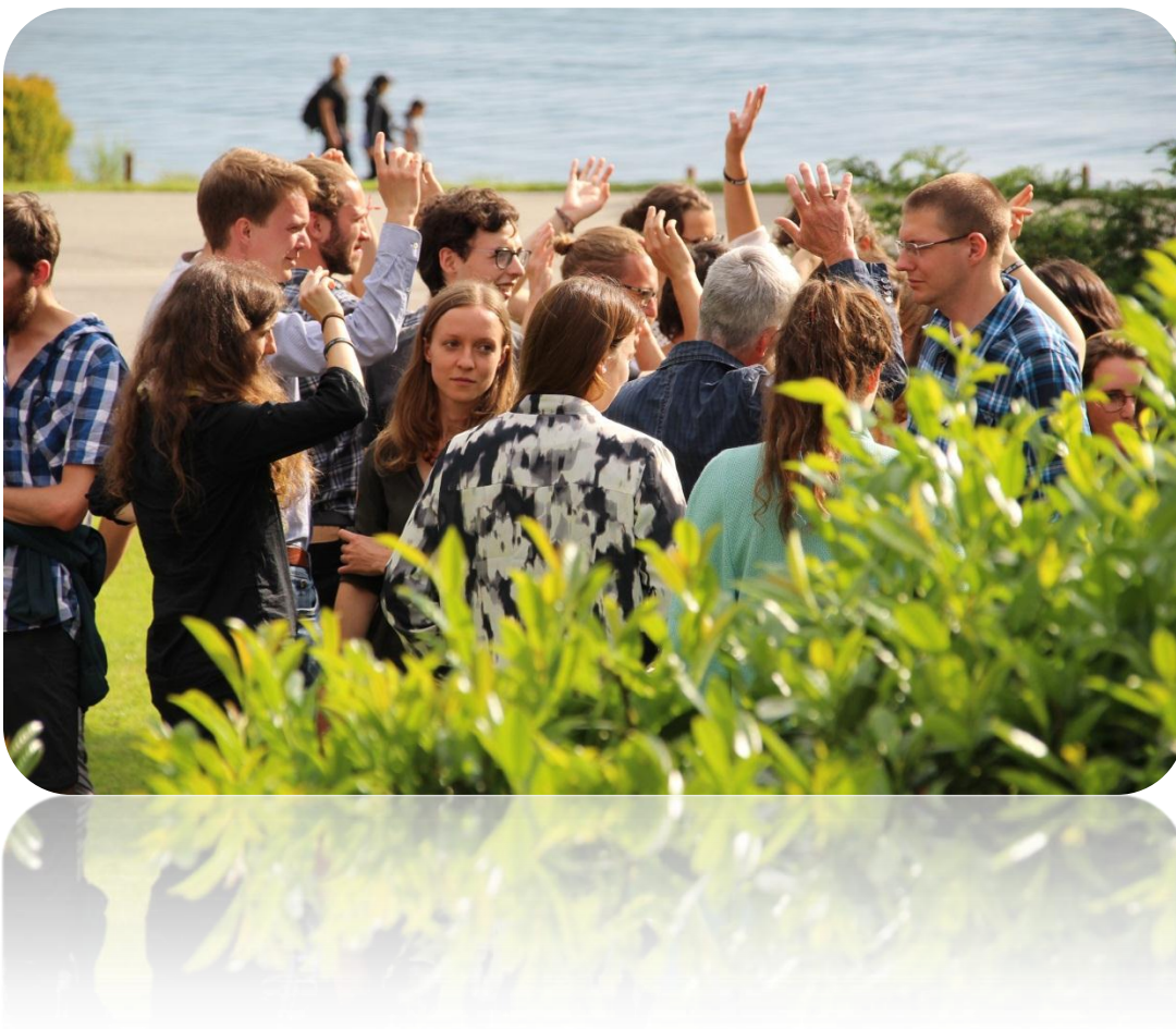
Picture 13: Participant's interests in following Living Labs activities