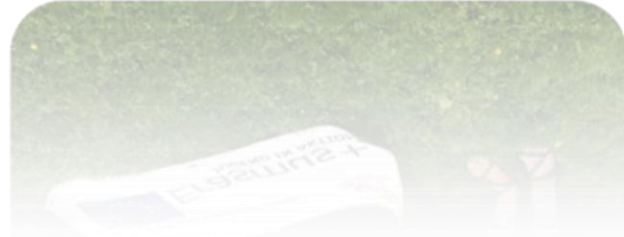
Picture 3: Living Labs workshop coordinators