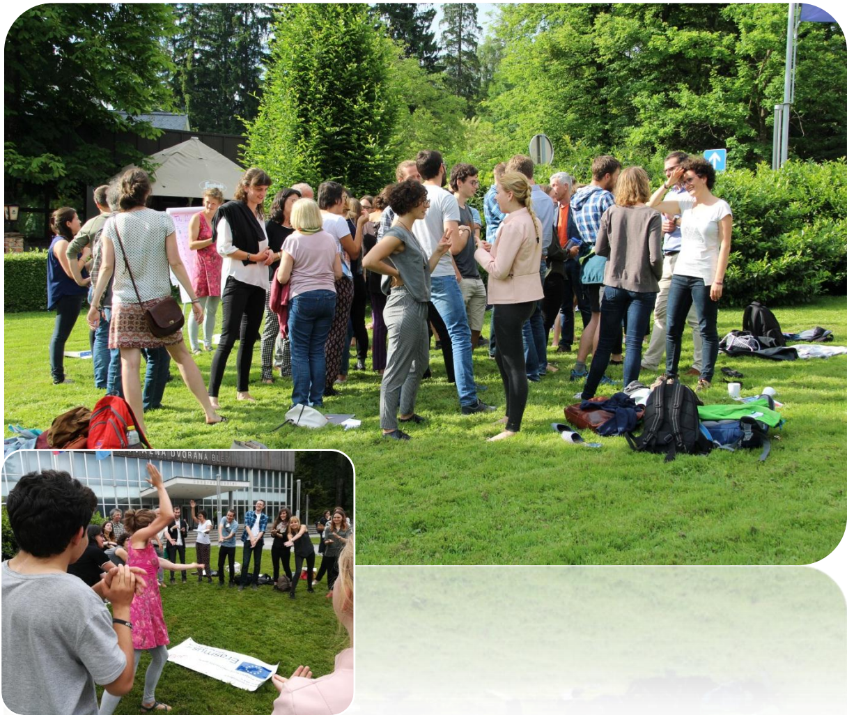
Picture 10: Energizers, important activity of people for getting to know each other