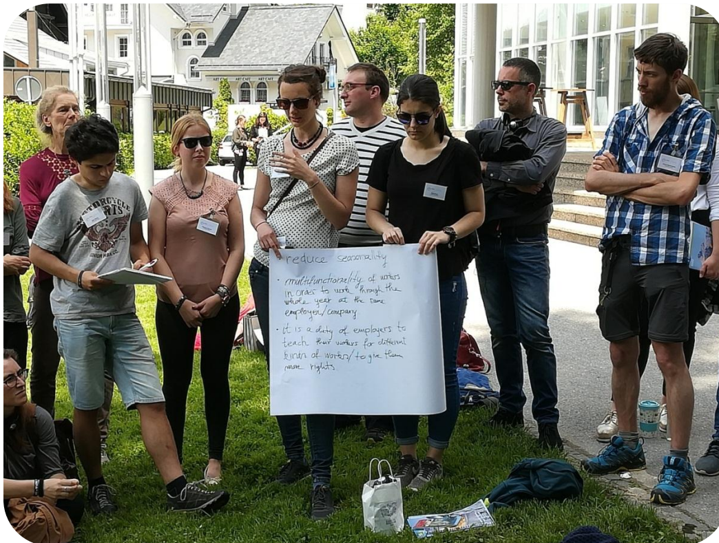
Picture 5: Representation of results by Austrian Living Labs participant