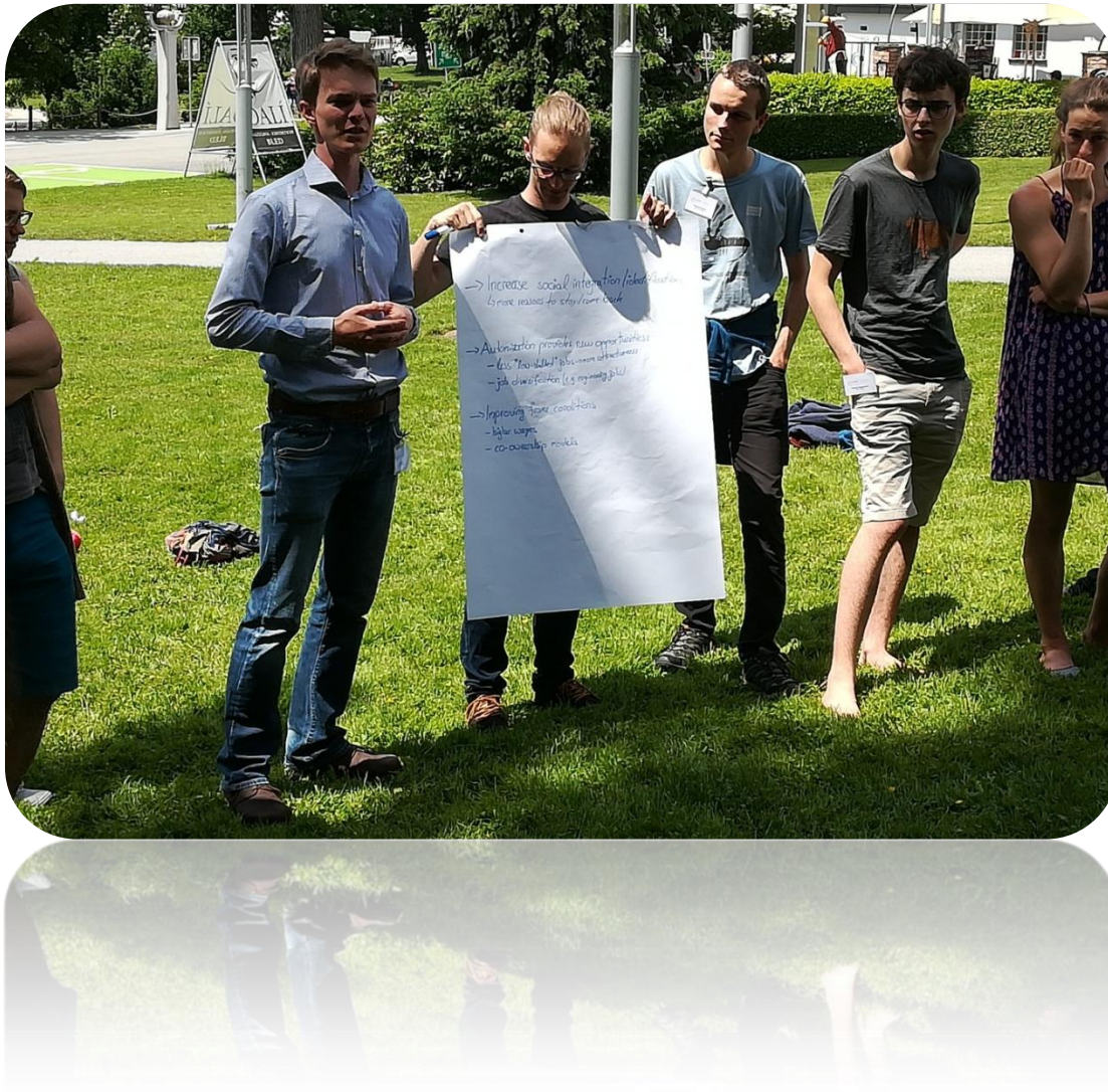
Picture 6: German participant of Living Labs project during representation of working group 3 results

Proposed measures of LL working group 4 are: