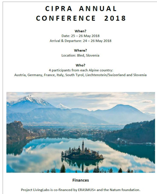
Picture 1: First site of the official letter for chosen participants of CIPRA annual conference and LL workshop

One of the topics, on which Living Labs project focuses are job opportunities of young generations in Alpine regions. Different job and employment opportunities have represented the main field of discussion of first Living Labs (in following LL) workshop.