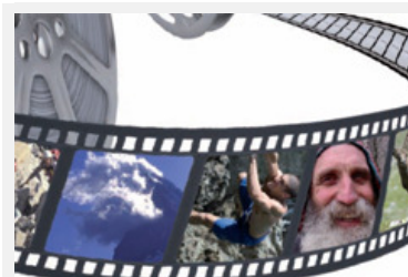
"Mountain Film Festivals in the Alps" is the name of a brochure created to attract the attention of a wider public to today's mountain film festivals and the Alpine Convention.

The brochure can be downloaded as a pdf file in English and the languages of the Alps at: http://www.alpconv.org/documents/Permanent_Secretariat/web/FilmF/Opusc_FestivalAlpi_100dpi_ING.pdf (de/fr/it/sl/en)