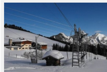
The ski area in Abondance/F is re-opening for business in December 2009.

Source and further information: CIPRA France, http://www.actumontagne.com/abondance-va-rouvrir-son-domaine-skiable-article_0906.html (fr)