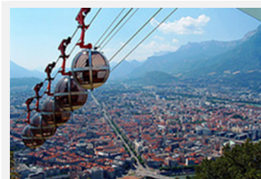
Nine Alpine towns and cities, among them Grenoble/F, are committed to tackle issues of climate change without delay.