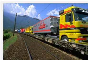
Transport Protocol: relocating road freight traffic to the railways using the appropriate infrastructure and market-compliant incentives

(07.05.2009) At the end of April 2009 the European Parliament agreed to the ratification of the Alpine Convention's Transport Protocol. In doing so it agreed to reshaping Europe's transport policy in favour of environmentally and user-friendly forms of transport and the protection of the Alps. Among the topics agreed upon on the Transport Protocol is a reduction of the negative effects of the risks posed by intra-Alpine and transalpine transport, in particular by transferring the volume of traffic from the roads to the railways. On the European Union's side, ratification by the EU Council of Ministers is now outstanding. To date, five contracting parties – Austria, Germany, France, Liechtenstein and Slovenia – have ratified the Transport Protocol, but not Italy, Monaco and Switzerland. Whether or not the Transport Protocol is ratified by the European Union is questionable. The Protocol is being blocked by Italy, which has so far defaulted as a contracting party. It is up to the Czech EU Council Presidency, among others, to convince Italy of the urgency of ratification so that the Transport Protocol can appear as an agenda item at the next meeting of the Council of Transport Ministers scheduled for 11 – 12 June 2009. Source: CIPRA