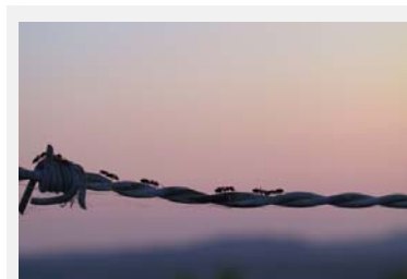
Biotope networking is the subject of this edition of Alps insight t: "Schengen for Flora and Fauna".

For further information, go to http://www.cipra.org/szenealpen (de/fr/it/sl), http://www.econnectproject.eu/ (en), http://www.alpine-ecological-network.org/ (en)