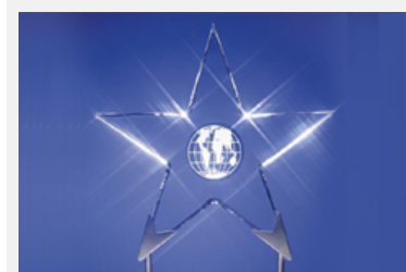
Teyssières/F promotes solar energy.

Information: http://www.res-league.eu/ (de/ fr/en)