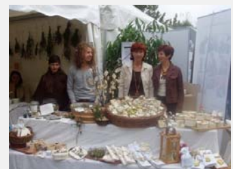
The Alchemilla women's project funded through DYNALP 2 brings value added to the region.

Info: http://www.alpenallianz.org/en/projects/dynalp2 (en, de, fr, it, sl)