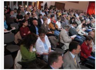
The conference on climate change in Bad Hindelang, September 2006.

Throughout the project, a strong public presence was maintained in order to reach out to as many people in the Alps as possible. In particular, CIPRA produced a number of publications such as the 3rd Alpine Report, CIPRA Info Special no. 82 and the proceedings of two international CIPRA conferences, namely "Alpine Town, Alpine Country" and "Climate – Change – Alps". External publications during the project period included six books and volumes of conference proceedings with chapters devoted to the project and its results as well as about forty articles published throughout the Alpine region in journals and on various websites. Future in the Alps was regularly represented at relevant events; members of the core team and groups of experts made presentations and distributed project literature at about forty conferences. Some forty websites of relevance for sustainable development and the Alps offered links to our project website. CIPRA announced all project milestones in the form of press releases in five languages.