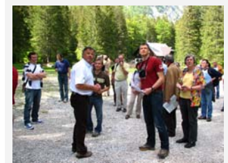
Visits to successful projects were a part of all the workshops.

Workshop documents are on-line in the respective languages of each Workshop available: http://www.cipra.org/en/future-in-the-alps/downloads