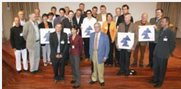
The total value of the awards made was 150,000 euros.