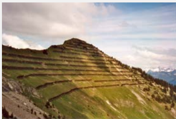
Are the measures taken for climate protection and adaptation really sustainable?