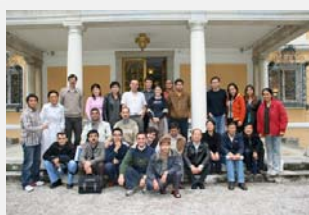
The global knowledge transfer group from Asian mountain regions.

Future in the Alps organised a further training programme in collaboration with the Inwent development organisation. Twenty-five individuals from Asian mountain regions made use of the opportunity to access the know-how and experience available in the Alps for subsequent transfer and application in their respective countries on completion of the twelve-month course.