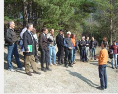
The networking among participants was helped along by the exchange of know-how, the field trip and the fine weather

The sunny weather, combined with the successful Valais setting with wine tasting and a delicious raclette, not only provided the perfect framework, but also served to promote the networking among the participants, who took home not just the know-how and new incentives and ideas, but also lots of interesting new contacts.