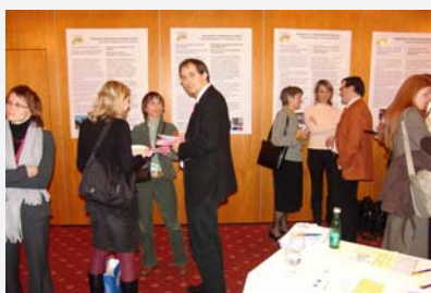
More than 100 people from Austria, Italy, France and Germany took part in the workshop.

The fourth workshop in the international series of workshops “Disseminating Knowledge – Networking People” was held in Warmbad-Villach (A) on February 28 and May 1.