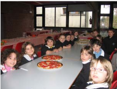
The children prepared the fruits in the school laboratory, which was set up thanks to the Award from Future in the Alps.