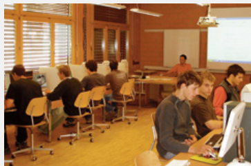
Computer courses are a matter of course in Poschiavo

The second workshop in Future in the Alps’ international series of workshops is to be held in Poschiavo in southern Switzerland on 30 November and 1 December. The theme of the event is “From peripheral geographic location to virtual centre: ICT in a rural-alpine region” and is being organised by Polo Poschiavo.