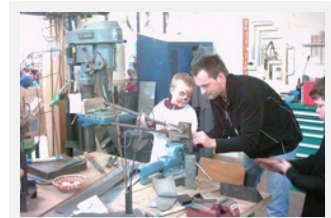
Children's workshops are just part of the extensive programme on offer from the Kempodium

Information: http://www.kempodium.de (de)