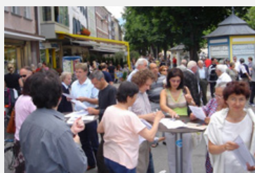
A new referendum is intended to help relieve Merano of its burden of traffic

In 2005 the Self-administered Referendum on the Future of Mobility in the Puster Valley won a prize as part of CIPRA's Future in the Alps competition. The project has certainly made waves.