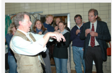
A visit to the successful Heu Vital project in Pfronten

It revolved around the question as to whether and under what circumstances a project such as the “Allgäu / Tannheimer Tal Nature Park” is in keeping with a trend supported by the regional population. The theme was addressed as part of presentations on successful examples of projects (the Biosphere Reserves of Grosses Walsertal and Entlebuch as well as the Sölk­täler Nature Park), an excursion to the Pfronten area, discussion groups, and personal conversations during the social programme and its culinary highlights. Even if the participants were unable to reach a conclusive answer to the question, the workshop did provide an opportunity for them to make valuable contributions towards a more in-depth discussion of sustainable development in the region.